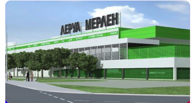
Non-food oriented retail