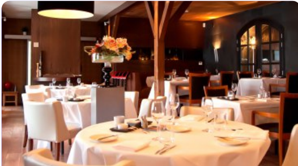
Restaurant business and food services