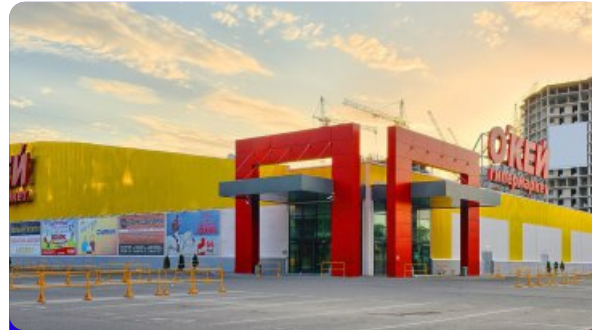
Food oriented retail