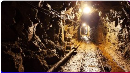
Mineral resource industry