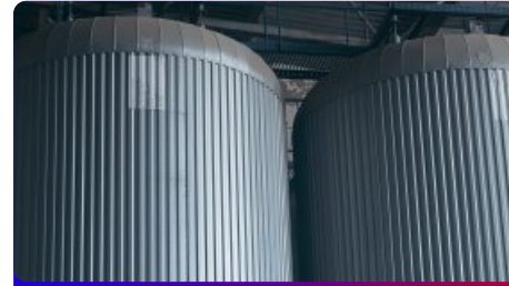
Hydroelectric power plants